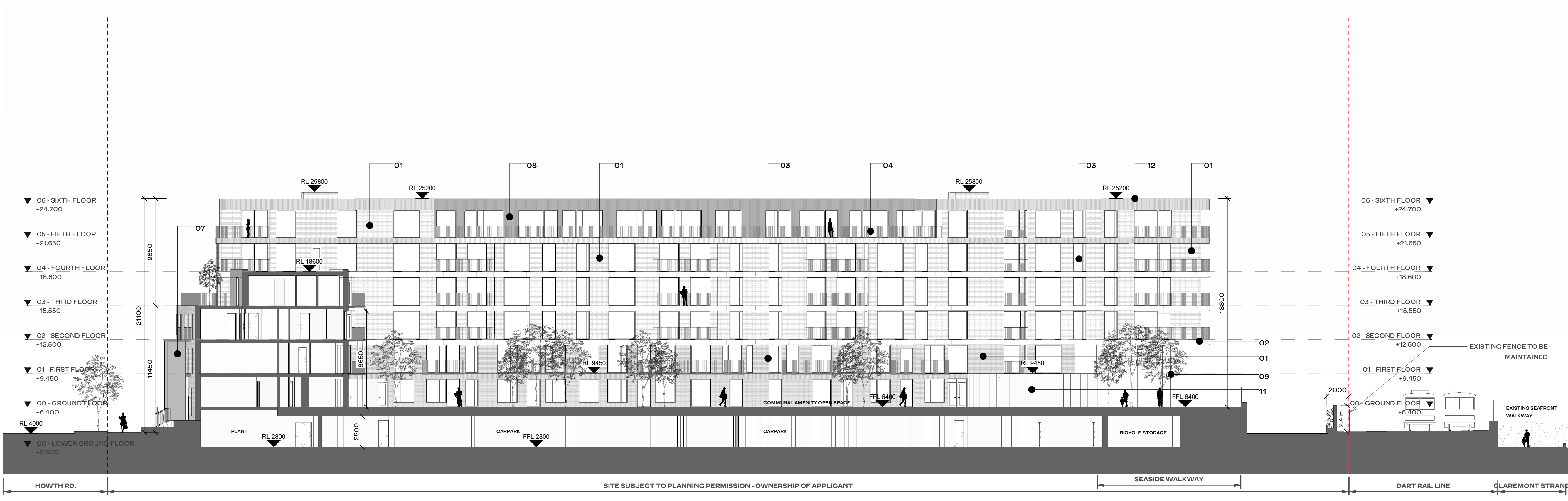
1 BLOCK A - COURTYARD EAST ELEVATION 1:200