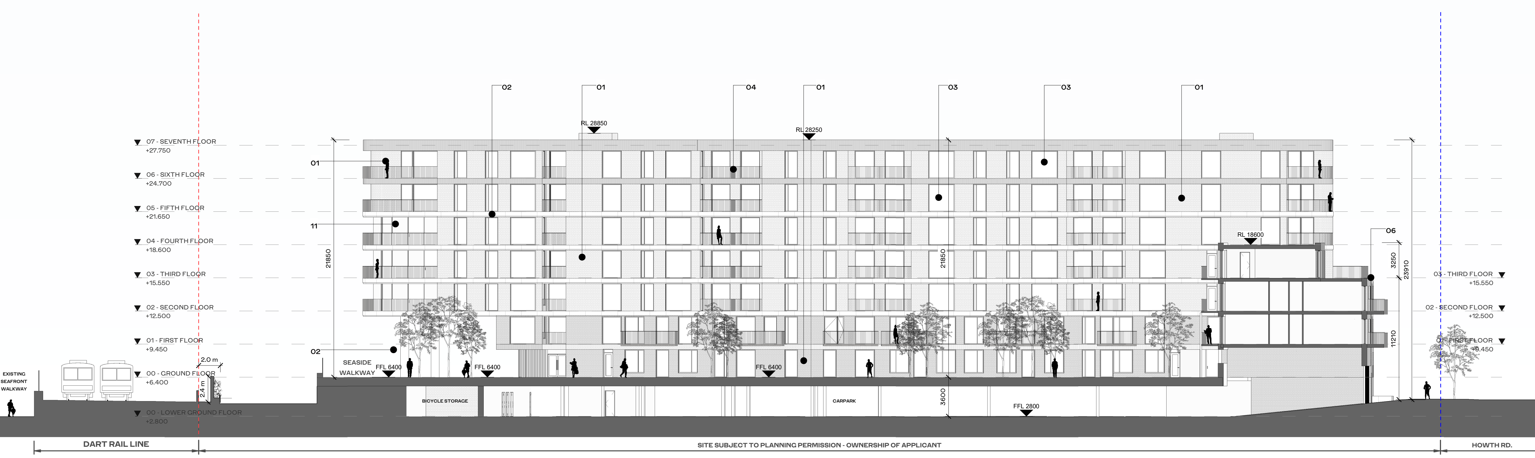
2 BLOCK A - COURTYARD WEST ELEVATION 1:200

ALL APARTMENT TYPES SHOULD BE READ IN CONJUNCTION WITH DRAWING NO.S P1601, P1602, P1603, P1604 AND HOUSING QUALITY